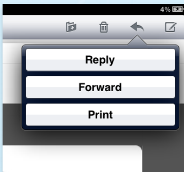
Tap Print. There is no need to leave the application.

Print from Apple® iOS devices using the native print function, without an additional mobile app. For Android devices, EFI offers a PrintMe Mobile app to print using the “Share” command or similar menu functions. Users may print to any network printer from Windows laptops and tablets using a single EFI print driver, from Mac computers using the Nearby Printers function and from Chromebooks using a Chrome extension for similar Wi-Fi functionality.