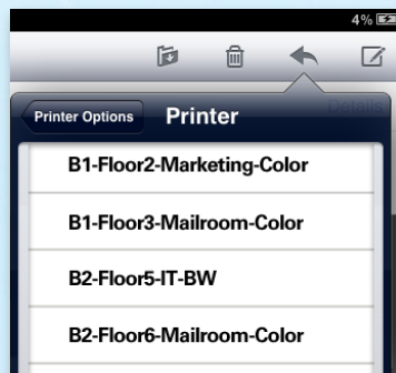
PrintMe Mobile automatically populates a list of available printers.